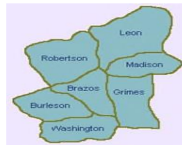
Brazos Valley Region

U.S. Department of Housing and Urban Development ( HUD ) Resource Locator ( https://resource.hud.gov/ ) was compiled to assist low-moderate income families locate DECENT, SAFE, and AFFORDABLE rental housing and other associated resources. HUD provides funding for the various housing complexes and entities listed in this directory. However, HUD does not administer these programs directly. Persons seeking housing or services MUST apply directly to the Housing Authority, Apartment complex and/or the entity listed within this guide.