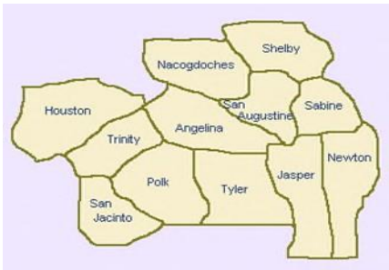
Deep East Texas Region