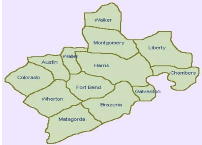
Houston-Galveston Area Region