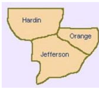
Southeast Texas Region